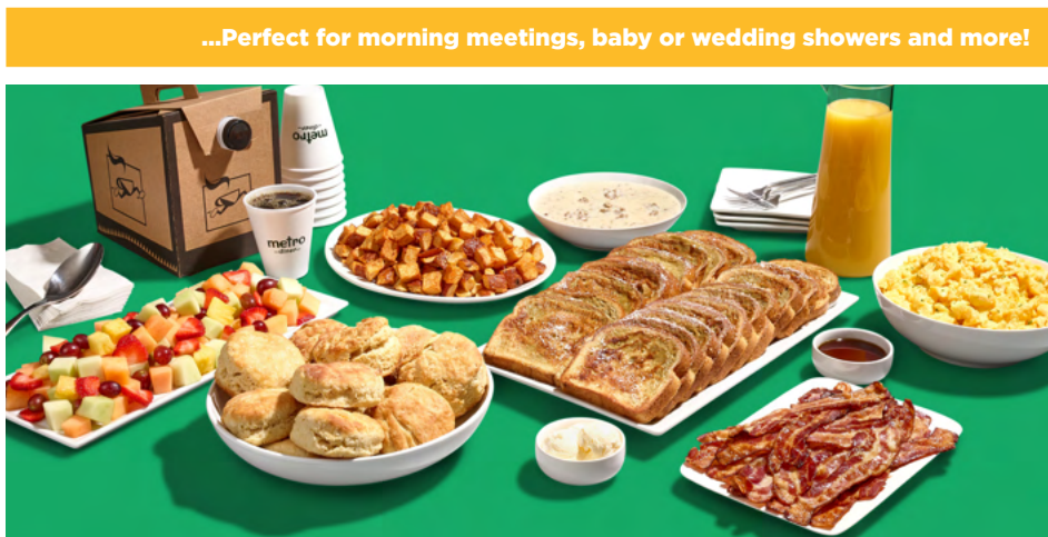
...Perfect for morning meetings, baby or wedding showers and more!