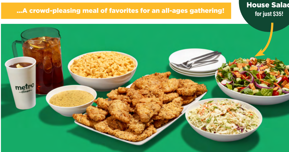
...A crowd-pleasing meal of favorites for an all-ages gathering!

Upgrade your spread with a House Salad for just $35!