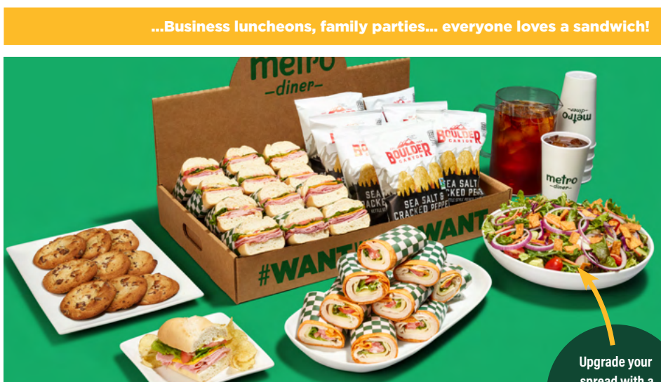
...Business luncheons, family parties... everyone loves a sandwich!

Avocado Veggie avocado, lettuce, black beans, onions, carrots, cheddar, fried jalapeños, sour cream, chipotle ranch